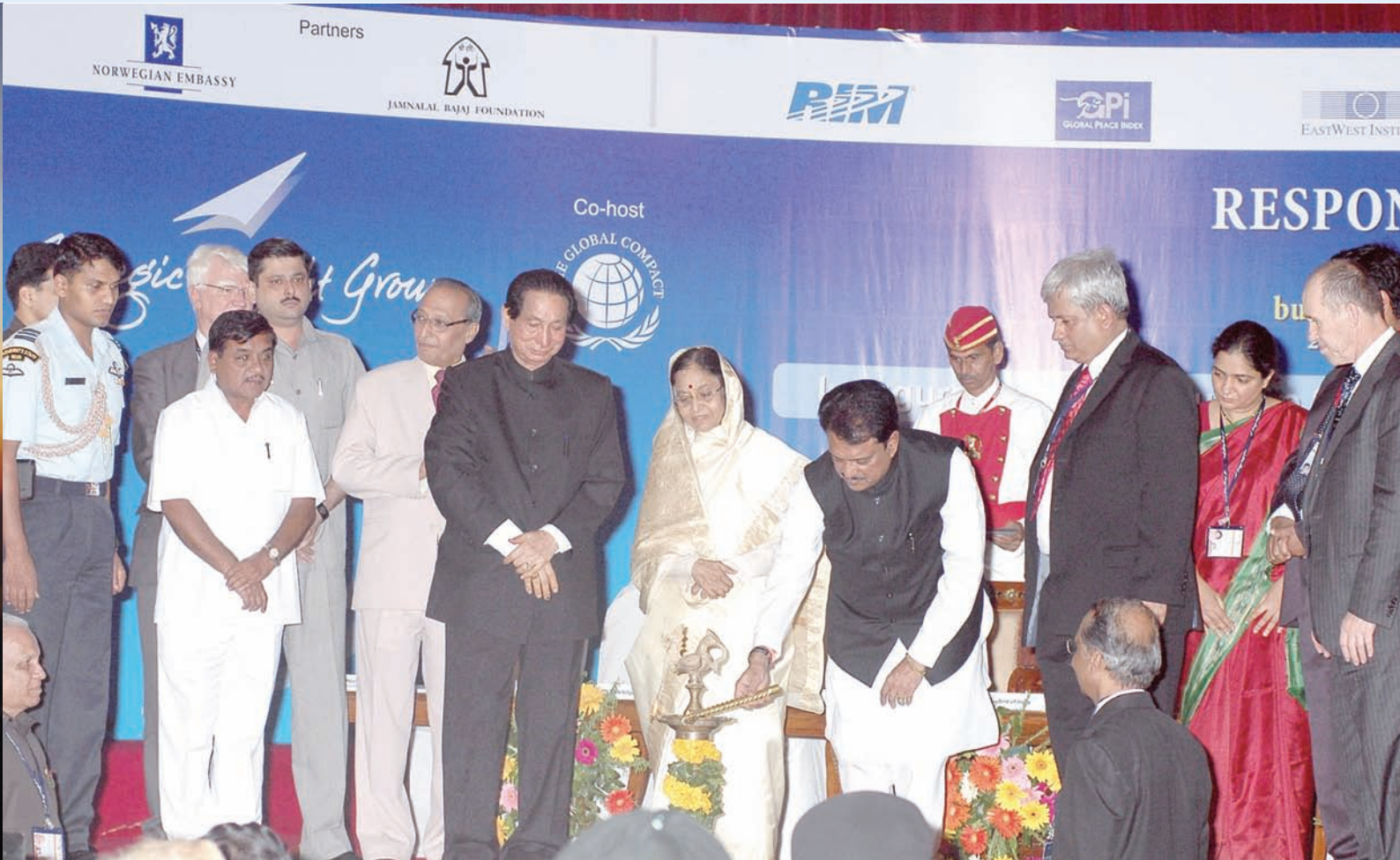
Smt. Pratibha Devisingh Patil looks on as Vilasrao Deshmukh, the then Chief Minister of Maharashtra lights the lamp at SFG conference. Also present are SFG founders: Sundeep Waslekar, Ilmas Futehally, Shrikant Menjoge