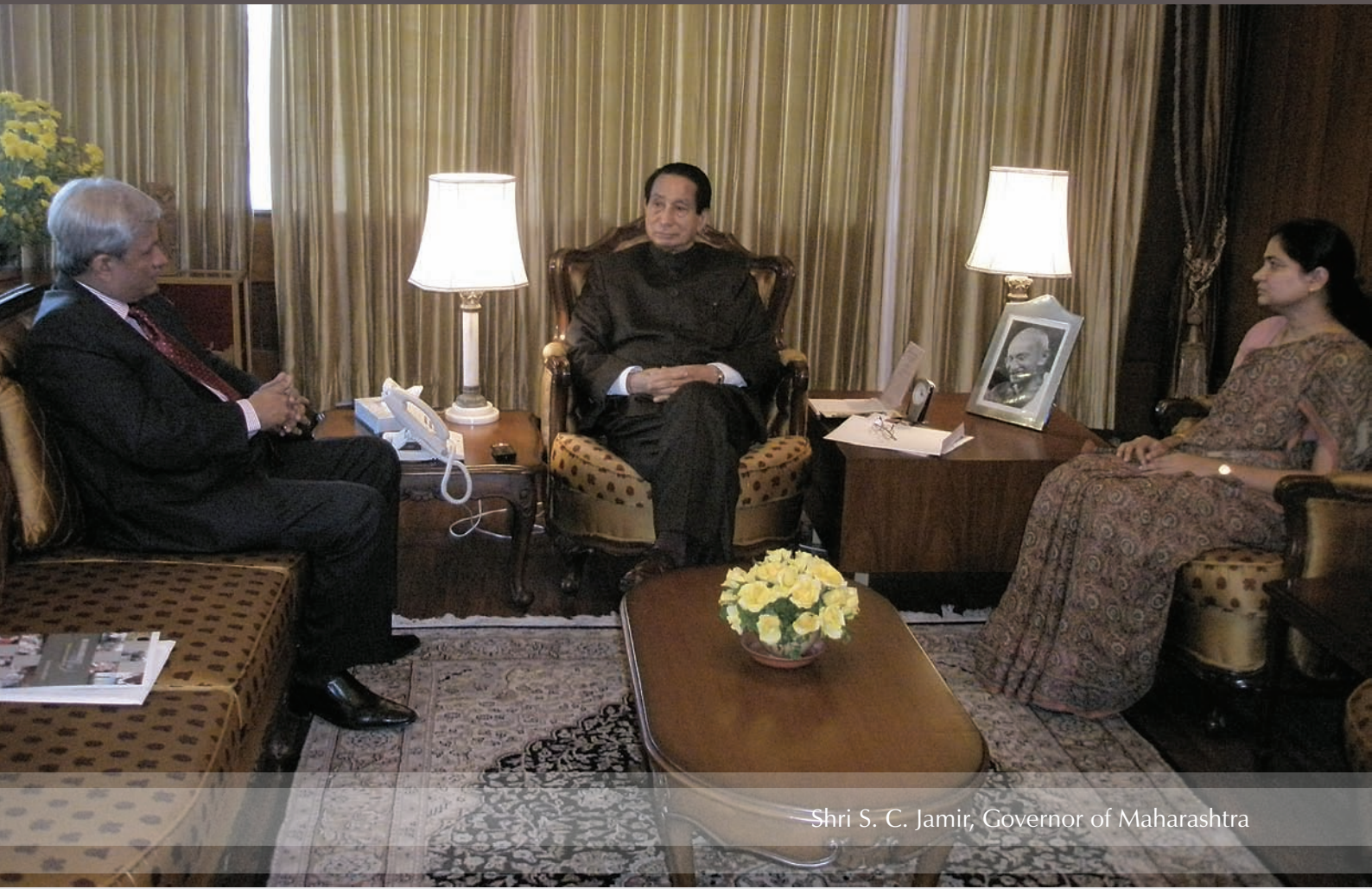
Shri S. C. Jamir, Governor of Maharashtra

“ In the last five years, we have watched the progress of this think-tank based in Mumbai with its ability to influence policy discourse not only in New Delhi but also in Brussels, Cairo, London and New York. The research reports of Strategic Foresight Group are always ahead of our times. ”