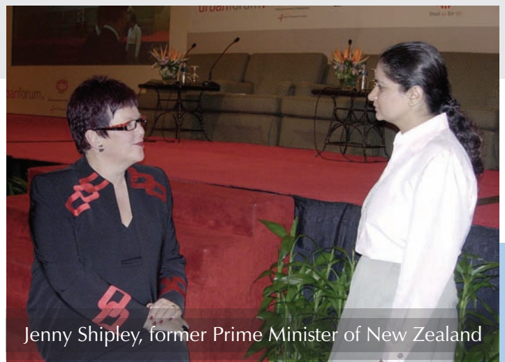
Jenny Shipley, former Prime Minister of New Zealand

Strategic Foresight Group has demonstrated in merely half a decade that it has the conviction and competence to develop an alternative worldview in a constructive way. We also have intellectual and political assets to draw input from all continents and deliver output to decision-makers anywhere in the world. We would now like to invite stakeholders and partners from different parts of the world to transform our promise into the reality of a collaborative global endeavour. We are confident that together we can make a difference.