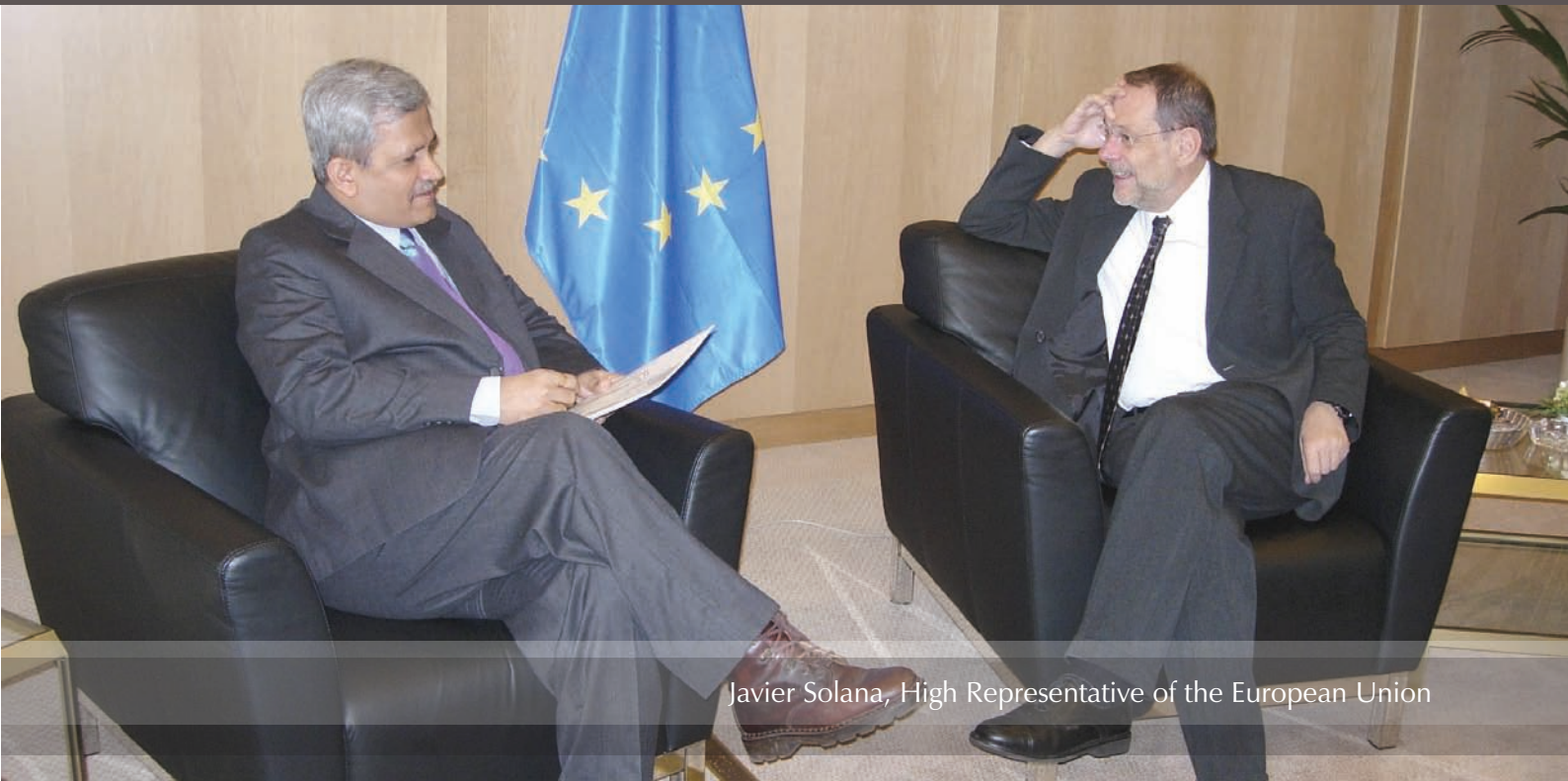
Javier Solana, High Representative of the European Union