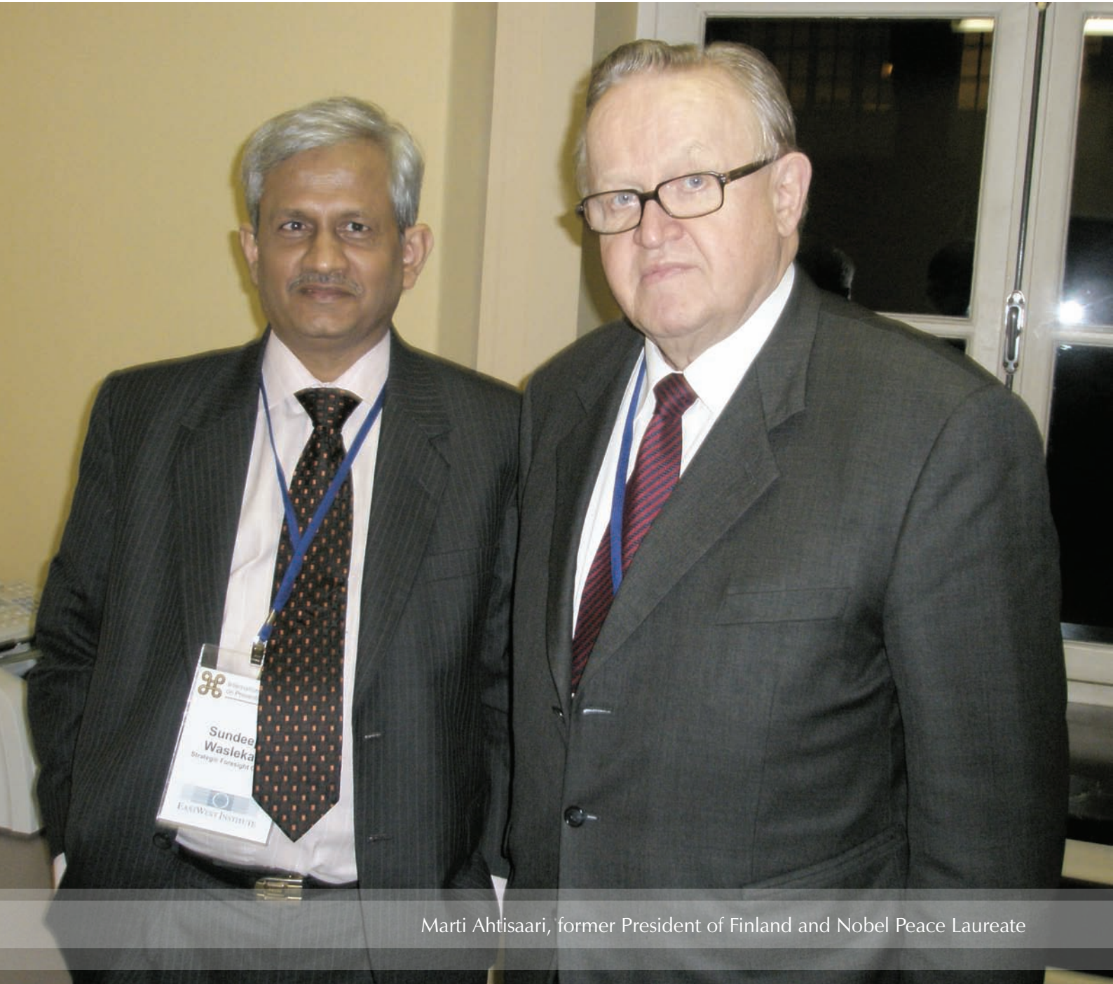
Marti Ahtisaari, former President of Finland and Nobel Peace Laureate

A great challenge of our time is to shift from the centuries old model based on the doctrine of enforcing national interests to a model based on the collaborative harnessing of the spirit of humanity.