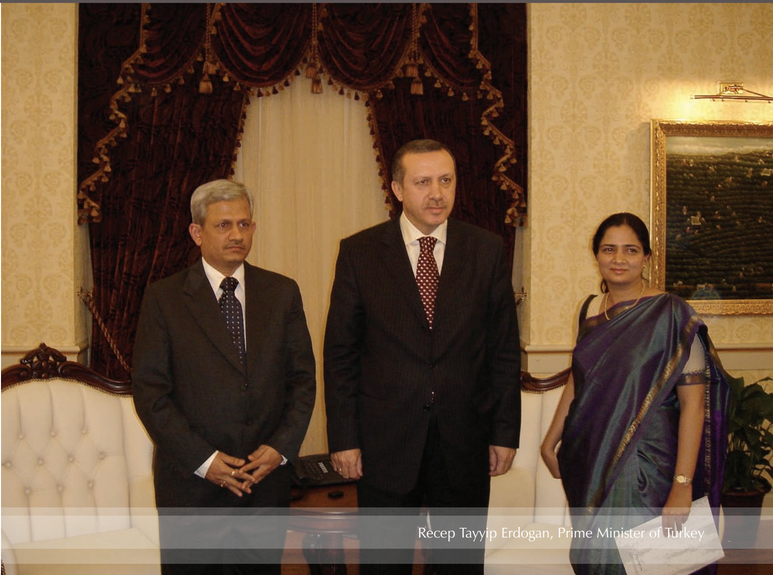
Recep Tayyip Erdogan, Prime Minister of Turkey

Strategic Foresight Group has demonstrated in merely half a decade that it has the conviction and competence to develop an alternative worldview in a constructive way. We also have intellectual and political assets to draw input from all continents and deliver output to decision-makers anywhere in the world. We would now like to invite stakeholders and partners from different parts of the world to transform our promise into the reality of a collaborative global endeavour. We are confident that together we can make a difference.