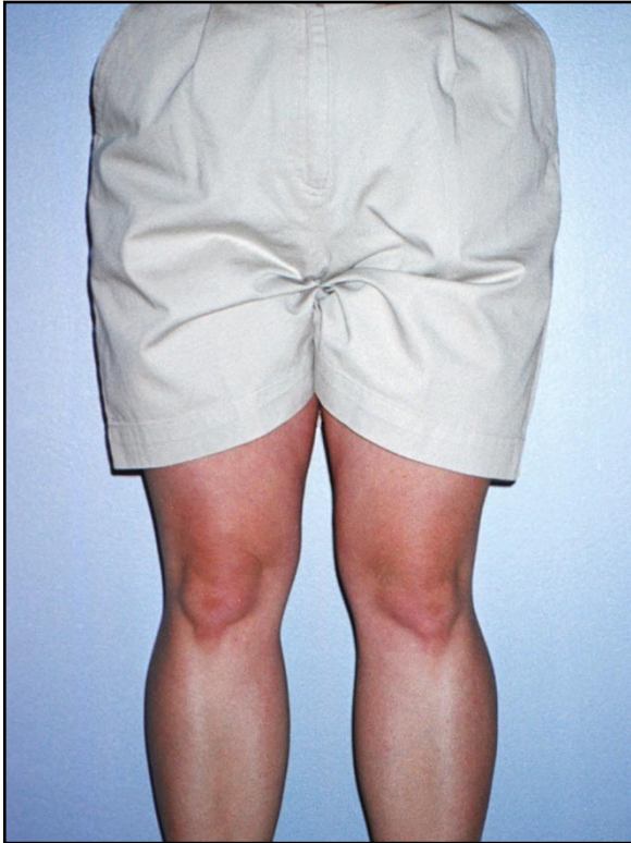
Before applying NoRiders 😞

Millions of people experience a very common problem while wearing shorts of any kind from virtually any clothing manufacturer. During the normal course of walking, hiking, running and playing sports, the inseams of the shorts tend to ride up the inner thighs and bunch at the crotch area. This results in discomfort in wearing them, embarrassment with how they look, and annoyance in having to repeatedly pull them back down. Is there a real solution to this problem?