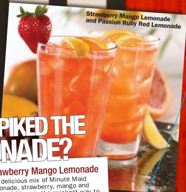
Strawberry Mango Lemonade and Passion Ruby Red Lemonade

It doesn't get any better than this mix of Captain Morgan®, pineapple and peach juices.