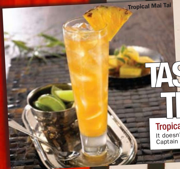
Tropical Mai Tai