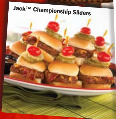
Jack™ Championship Sliders

Our mouthwatering Jack Daniel's® glaze gives unforgettable flavor to three of our most popular treats: crispy golden-fried shrimp, succulent Sesame Jack® Chicken Strips and tender baby back pork ribs.