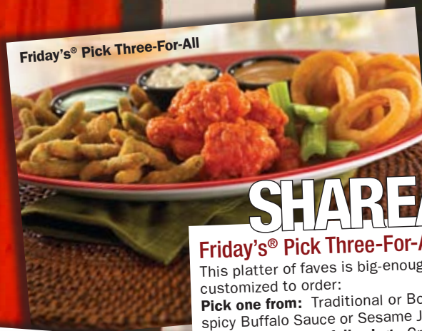
Friday's® Pick Three-For-All

Bring Your Own Buddy Summer Was Meant To Be Shared