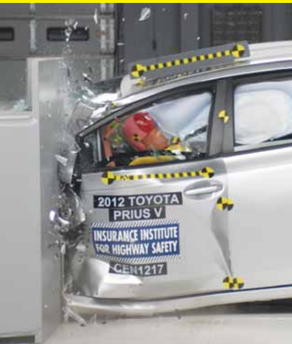
Toyota Prius v

The key to crash protection is a strong safety cage that preserves occupant survival space. Then restraint systems can cushion and protect people.